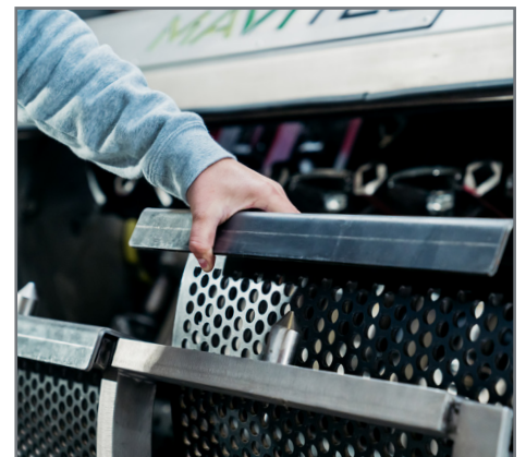
Easy screen exchange