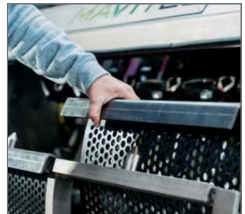
Easy screen exchange